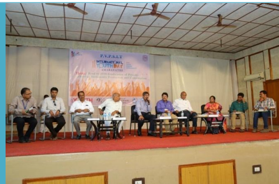
Panel Discussion with resource persons